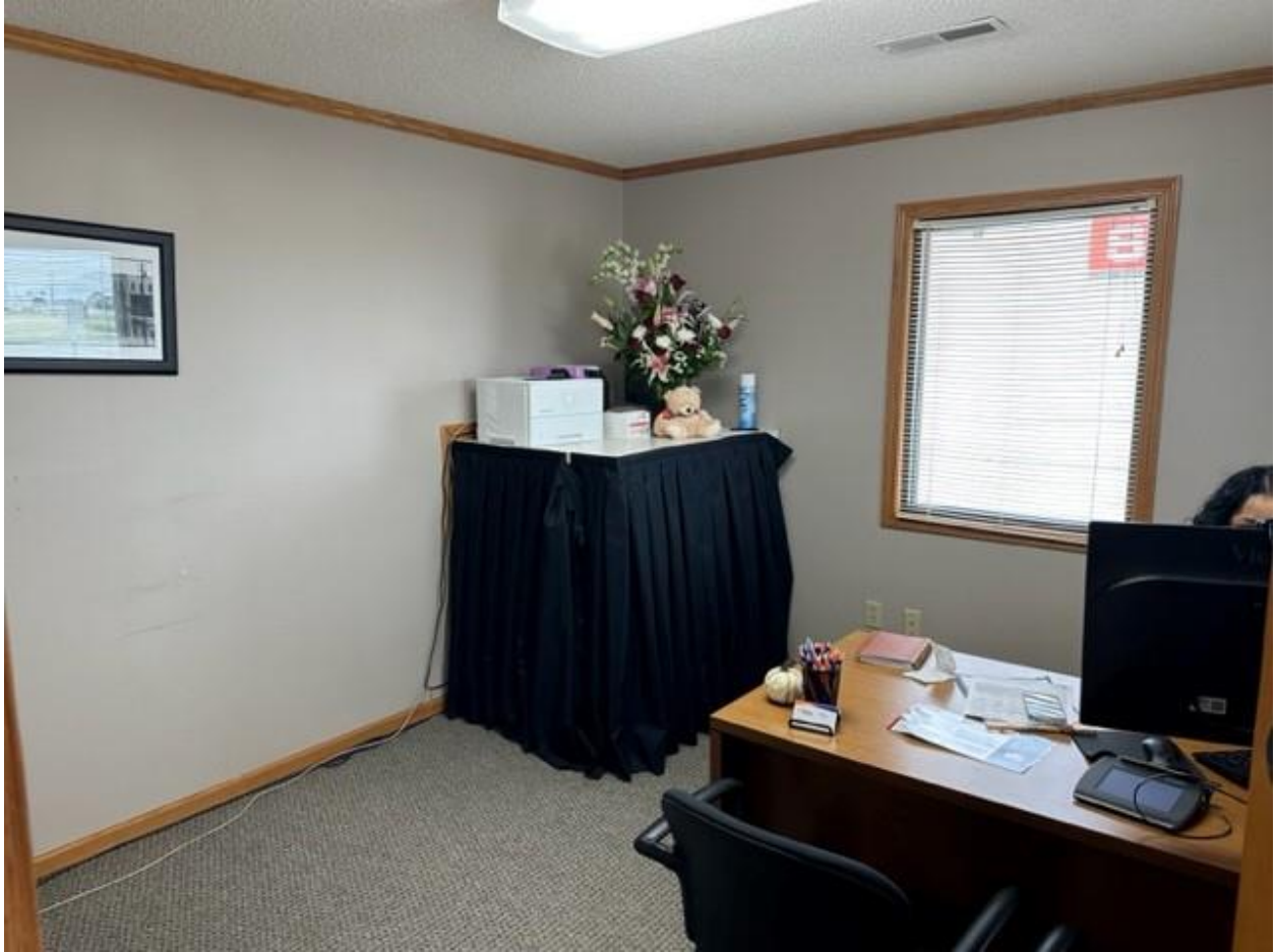
Office #2 with Vault