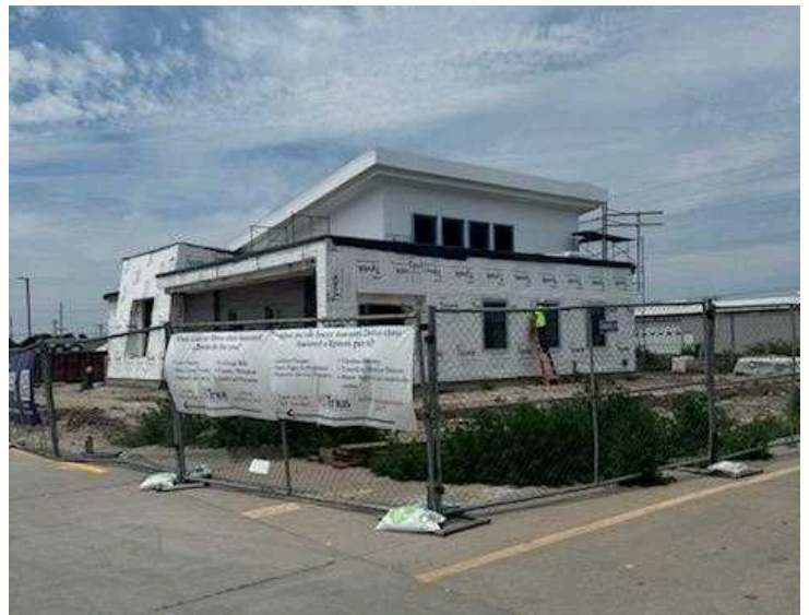
Lexington Exterior Progress