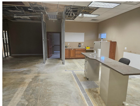
Grand Island Renovations