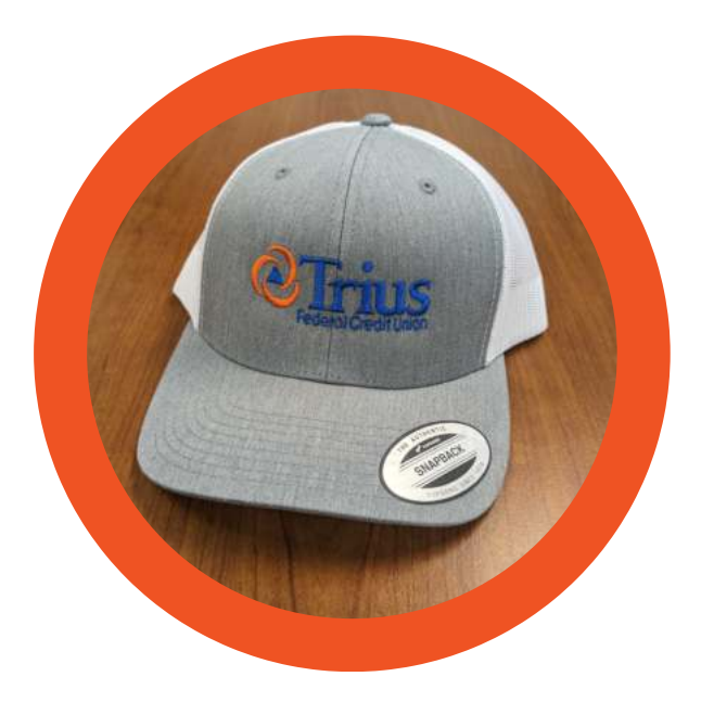
Trius Hats $20